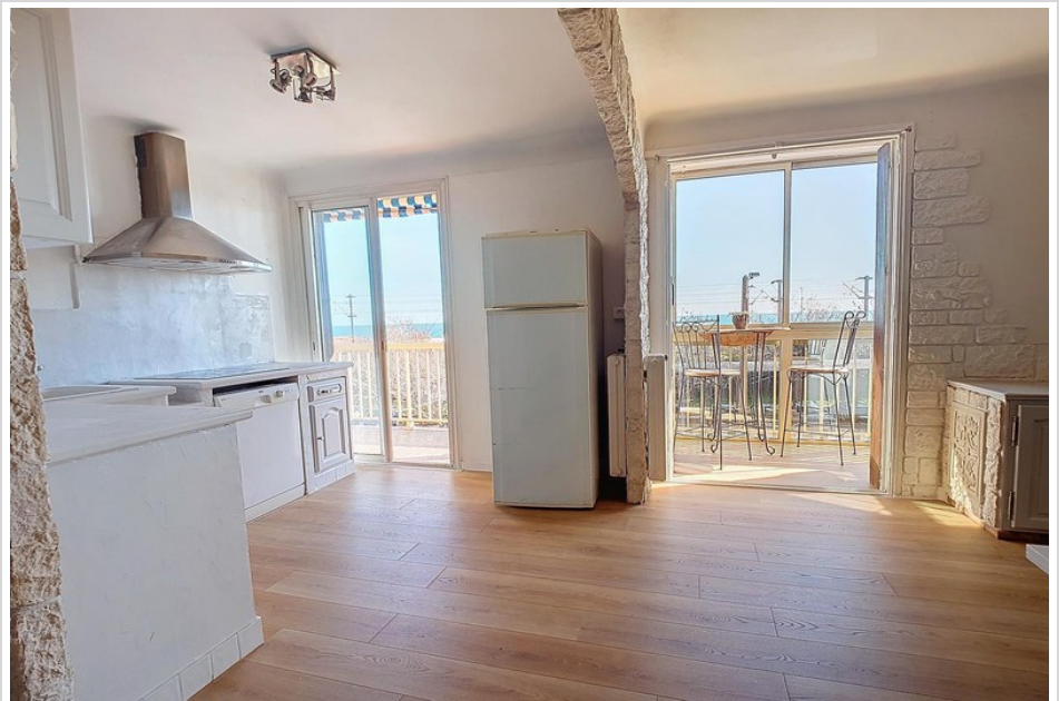
Apartment 793 Antibes