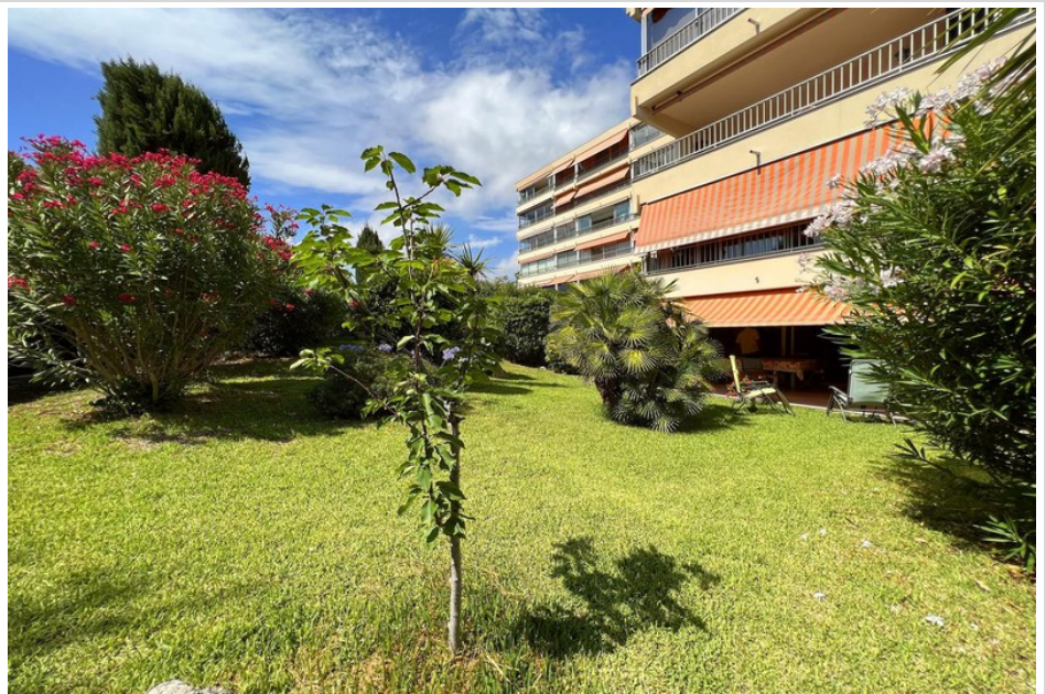
Apartment 1751 Antibes